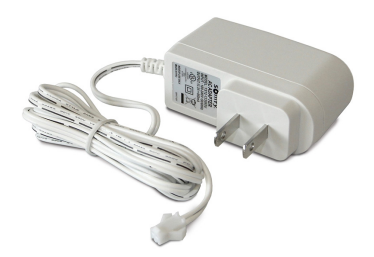
Sonesse 30 WireFree Plug-in Charger 9020672